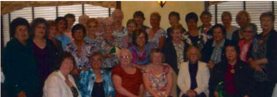
Class of 1957 at their reunion 55th reunion held June 9, 2012.