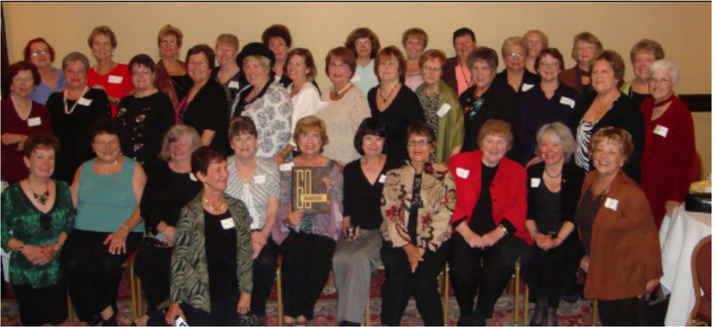
Golden Belle Class of 1960 held a great reunion