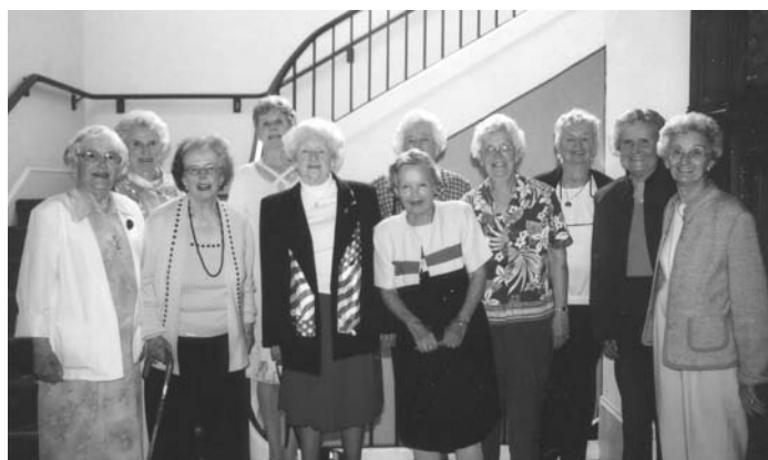
Members of the Class of 1941 gathered for their 65th anniversary. (see information p. 5)

Name, Address, City, State ZIP, Phone, Email and Birthday ____/____/____ (The BVMs would like to include you by name in their prayers on your birthday.)