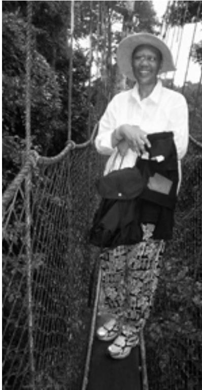
Atop the trees in Ghana's Kakum National Park 300 feet above the rainforest floor.