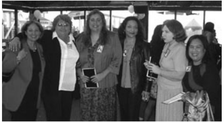
Members of the Class of 1973 get ready to talk all night!

Class of 1993 About 20 members marked their ten year reunion at a dinner at Buca di Bepo's on June 7, 2003. They've posted photos of the gathering at http://groups.msn.com/StPaulsSanFrancisco/classof199310year.msnw (see photo below)