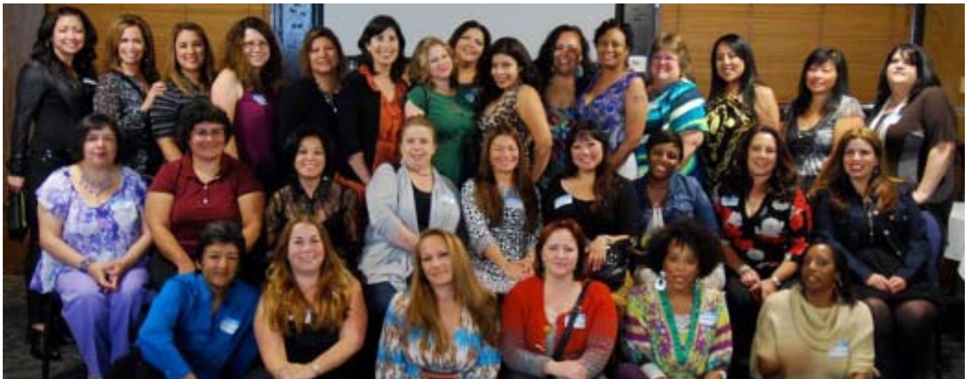
Class of 1983 at their reunion on October 26, 2013.