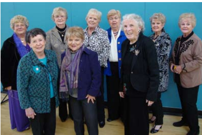
Nine members of the Class of 1950 made a special day of it too!

The Class of 1961 mark their 50th anniversary of graduation this school year, and as is the Alumnae custom, they were honored at the November 6, 2010 Mass and Luncheon with accolades proclaimed by their "little sister" hostesses from the Class of 1964 and the presentation of their Golden Diploma, which reads, in part, "On the semi-centennial of her successful completion to the prescribed Courses of Study, this special Golden Diploma is awarded to N . All rights and privileges theretofore extended are reaffirmed."