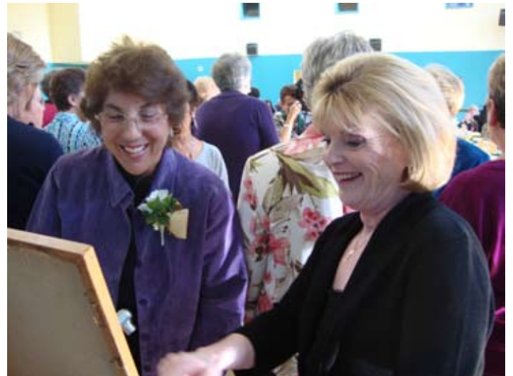
(below) An energetic (rowdy?) group from the 1970s has begun to make Candlelighting a fun get-together.