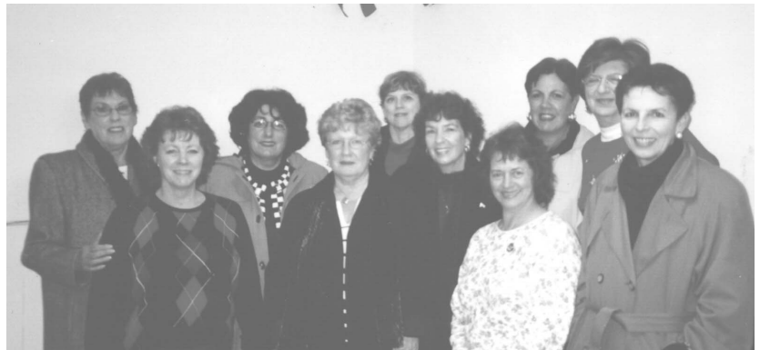
Members of the Class of 1961 were present in great numbers.