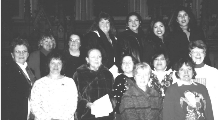
The volunteer choir did a great job!

Candlelighting has always been a special activity treasured in the memory of graduates spanning the nine decades of St. Paul High School. So the tradition of holding an Alumnae Candlelighting has been welcomed in the years since the school's closure. However, the retrofitting work in the church during most of 2000 was barely finished for the Christmas Eve Mass that year, and there was no possibility of any services in the church before that date.