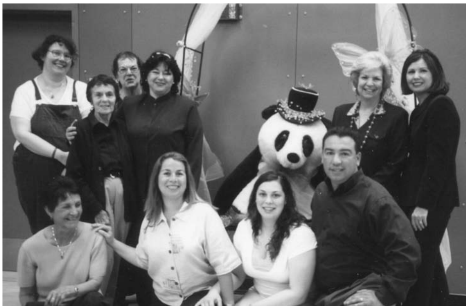
The great crew of workers and committee chairs posed with the beloved panda, who is always present at the Fundraiser reception.